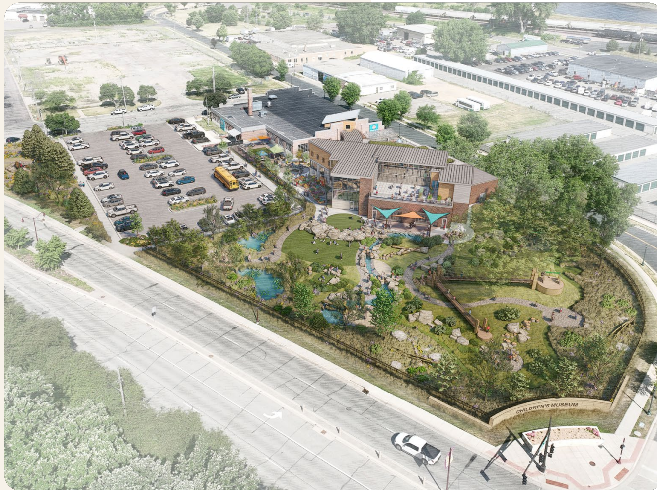
Renderings of the planned expansion