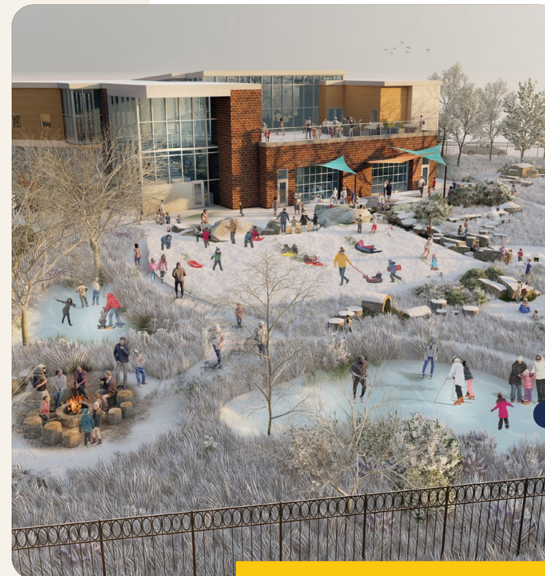
Expanding nature-based play year-round is a major priority at the Children's Museum